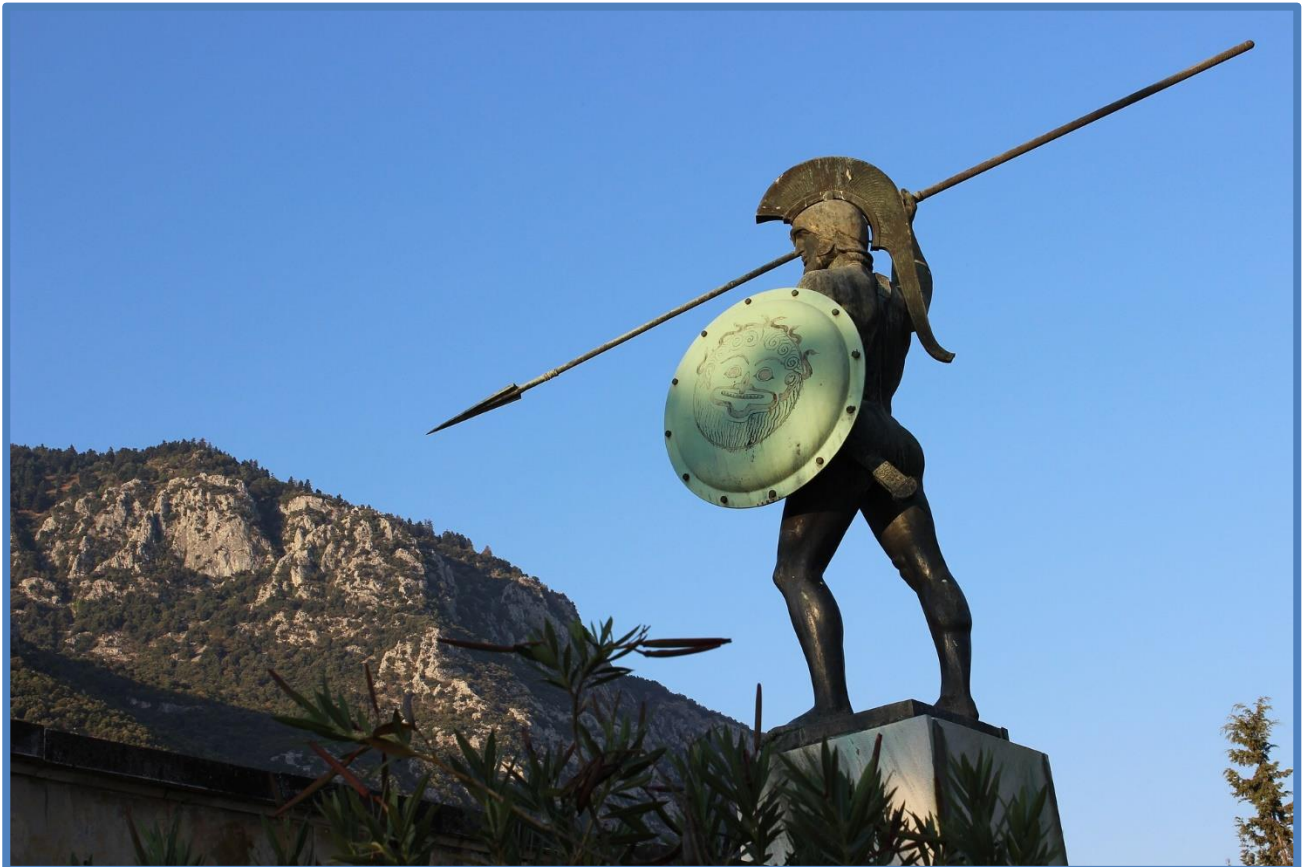
The statue of Leonidas at Thermopylae.