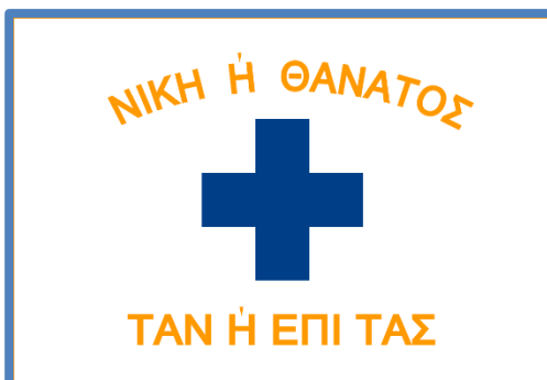
Flag used by the Maniots.

rather than forty years of slavery and prison ” (“Κάλλιο εἶναι μίας ὥρας ελεύθερη ζωή, παρά σαράντα χρόνια σκλαβιά και φυλακή”). Also, the paintings that commemorate that