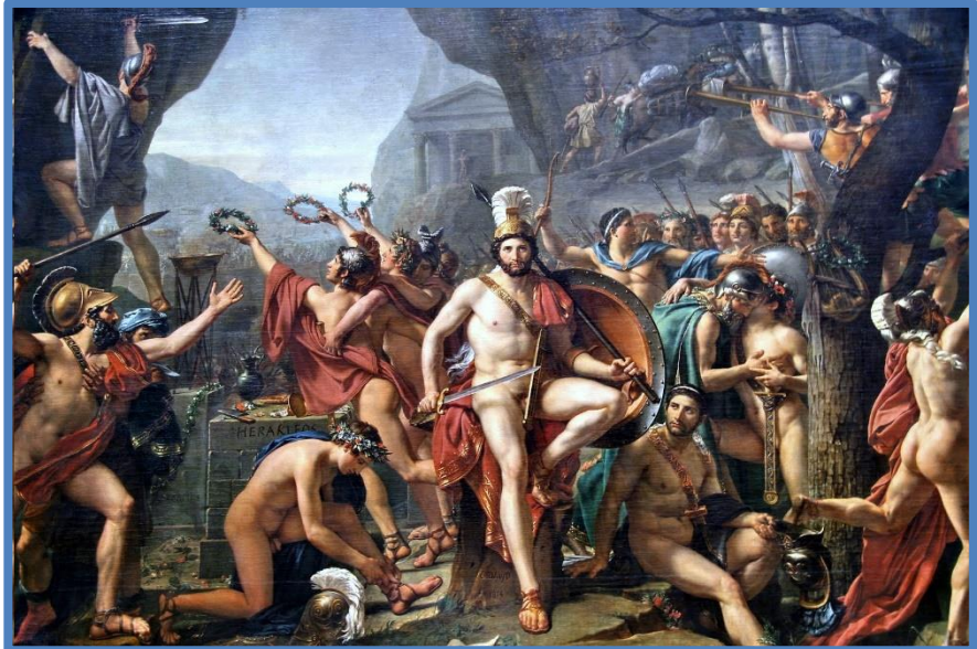
Leonidas at Thermopylae. Painting by Jacques-Louis David.

answer is famous: “Μολών λαβέ” , “come and take them” . The Greeks kept on fighting for three days, and the battle ended only when the last men who had remained at Thermopylae all died fighting. Probably, this is the most famous sacrifice at war in History, and it would become a basic foundational “Myth” not only for Greece, but for the whole of Western Civilization.