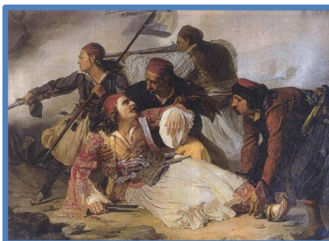
The death of M. Botsaris. Painting by Ludovico Lipparini.