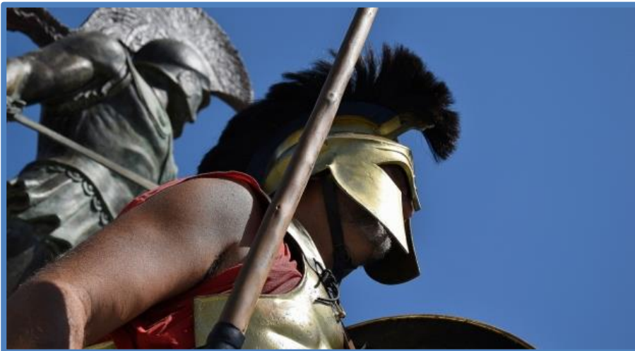
Reenactor in front of Leonidas' statue in Sparta.

https://notospress.gr/article.php?id=27898