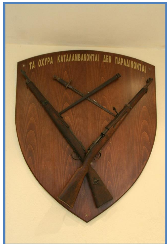
Coat of Arms with the words “Forts are not to be surrendered, they must be conquered» at Rupel.

But the Greek resistance did not end. Just before the Germans entered in the capital, Radio Athens incited the people to resist: “ Our war continues, and it will continue until the ultimate victory. Long live the Greek Nation! ” 4 .